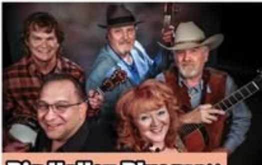
Big Valley Bluegrass