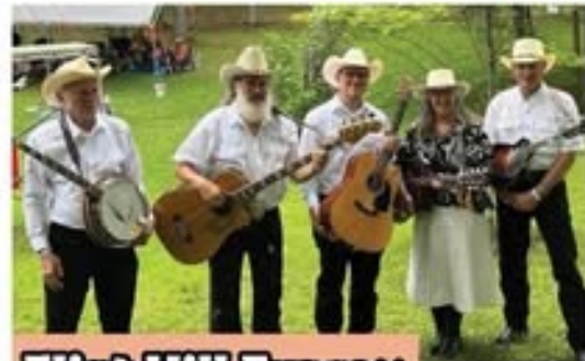
Flint Hill Express

Food, soft drinks, and alcoholic beverages are available for purchase. Outside alcoholic beverages are not permitted.